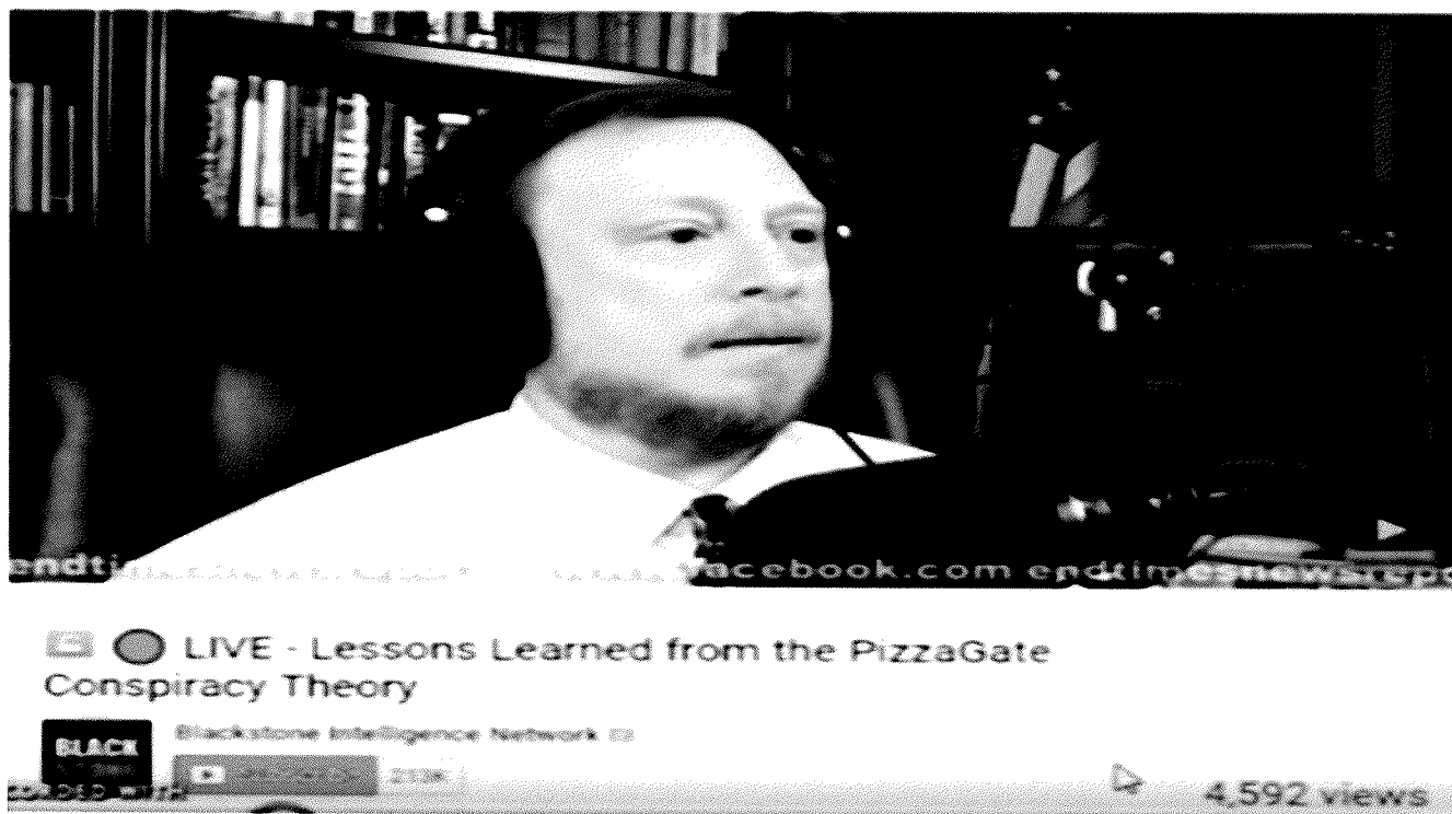
EXHIBIT #6 -DICTATION OF VIDEO (LIVE – Lessons Learned from the PizzaGate Conspiracy Theory) published April 6, 2019

*Note at the time you see the Defendant's face and hear the Defendant's voice, the Defendant states: